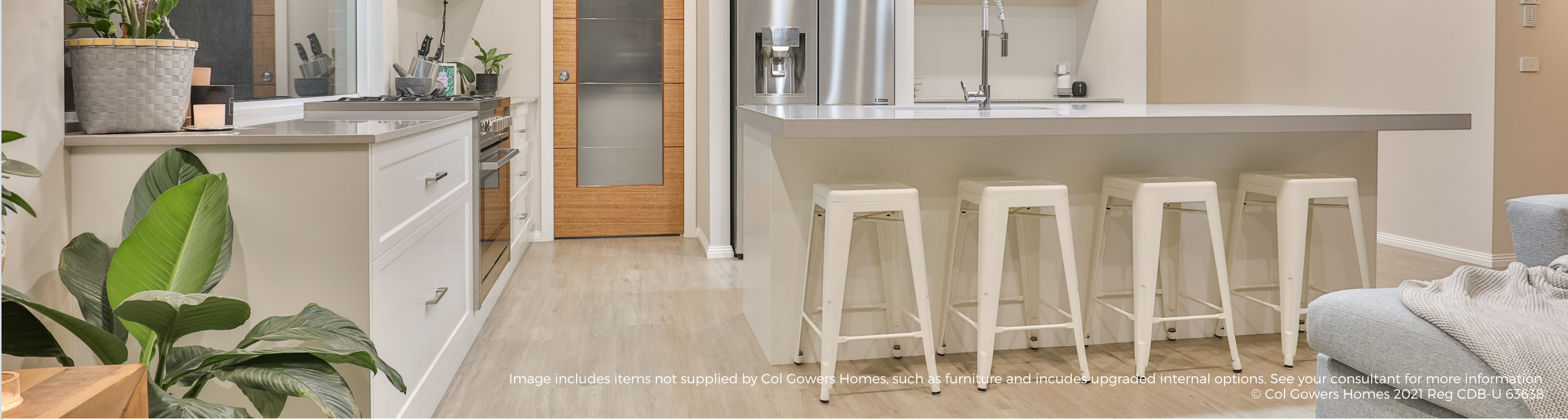
Image includes items not supplied by Col Gowers Homes, such as furniture and includes upgraded internal options. See your consultant for more information Reg CDB-U 63638